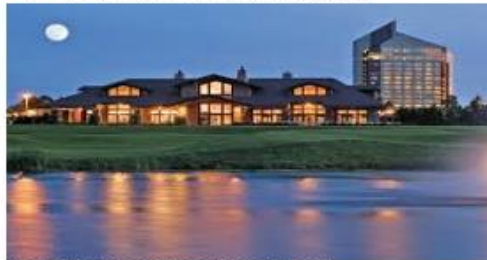
GRAND TRAVERSE RESORT BAYVIEW ROOM – 4 Guests / 2 Nights / 2 Rooms PLUS $3,500.00 CASH