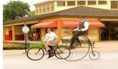
DEARBORN INN 4 Guests / 2 Nights / 2 Rooms * Includes Breakfast, Guest Passes to Henry Ford Museum, Greenfield Village Or The Rouge Plant PLUS $1,500.00 CASH

5 TH – 10 TH Prizes = $300.00 21 ST -30 TH Prizes = $120.00