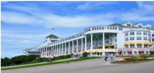
GRAND HOTEL, MACKINAC ISLAND 4 Guests / 2 Nights / 2 Rooms *Includes Breakfast and Dinner ** Excludes Holiday Weekends PLUS $12,500.00 CASH