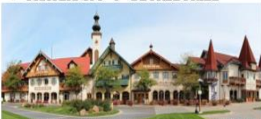
BAVARIAN INN, FRANKENMOUTH / LITTLE BAVARIA – 4 Guests / 2 Nights / 2 Rooms & 4 Waterpark Wristbands PLUS $2,500.00 CASH