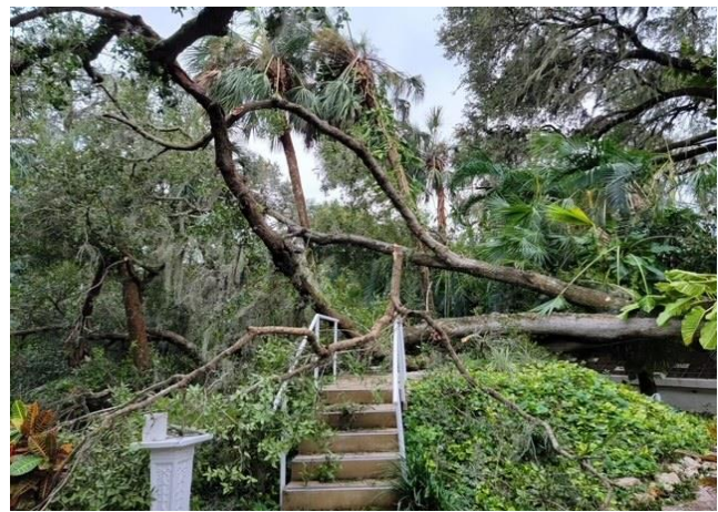
Photos taken after the hurricane