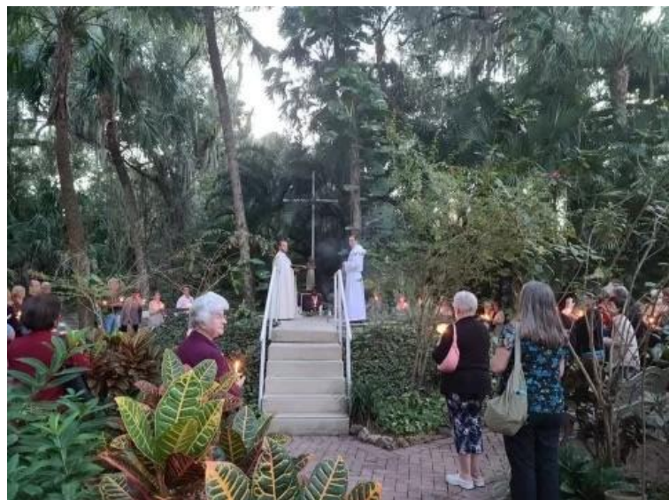
Photos of St. Cabrini, Parrish Florida Memorial Garden before Hurricane Ian hit.

In all things I have shown you that by working hard in this way we must help the weak and remember the words of the Lord Jesus, how he himself said, 'It is more blessed to give than to receive.'"