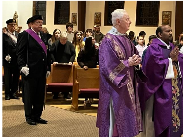
Joint Memorial Mass with Fourth Degree and our K of C Council 3956