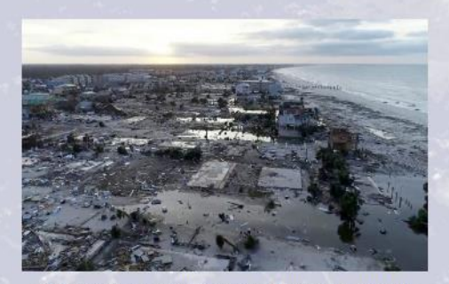
Devastation of Hurricane Michael - 2018

St. Roch Catholic Church 25022 Gibraltar Rd. Flat Rock MI